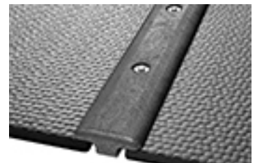
installation with KK-Poly-T-Bar e.g. for stall equipment with mushroom dividers or especially when using very fine litter