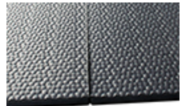
installation edge to edge