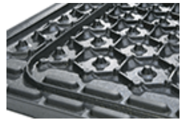
honeycomb texture and sealing lips on lower side